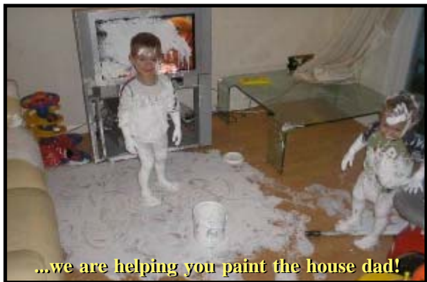
...we are helping you paint the house dad!

A little girl was watching her parents dress for a party. When she saw her dad in his tuxedo, she warned, "Daddy, you shouldn't wear that suit." "And why not, darling?" "You know that it always gives you a headache the next morning."