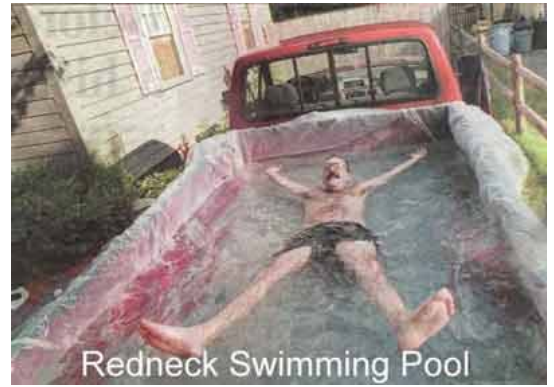
Redneck Swimming Pool

You know you're a redneck if... you use the bed of your truck as a swimming pool!